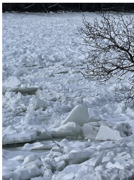
Ice and snow on the Kennebec River in Caratunk Maine.