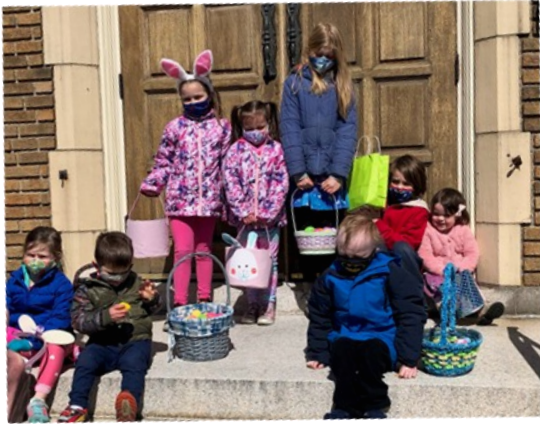
Kids of our church after the Easter egg hunt on the church steps.