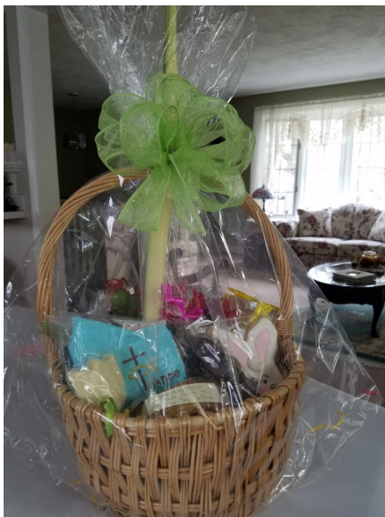
The deacons made Easter baskets for all of our shut ins.