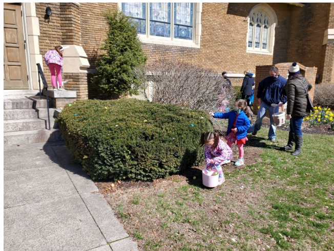
Kids of our church while on an Easter egg hunt!!