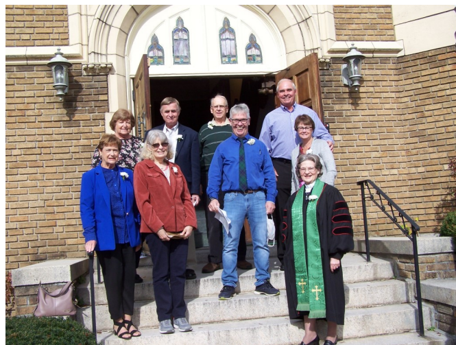
50 Year Picture from Heritage Sunday

Please send in photos of important events to the church office so that they can be put in the Newsletters