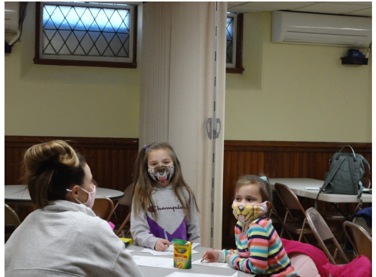
Children's Sunday School/UPCoW Chorus