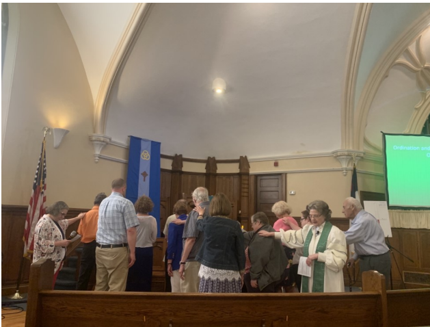
Laying on of Hands for Elders and Deacons.