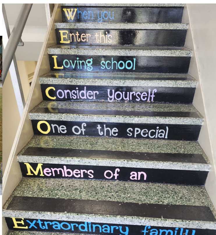
Tanya is overjoyed to see this every morning when she arrives at her new job.